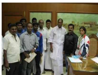
Pondicherry Chief Minister honors Karate student of Pattinacherri for participation in International competition