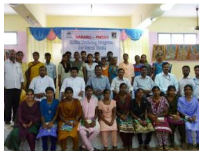
BPO Training Program Youth sponsored by NABARD