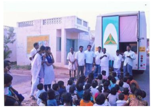
Health Awareness for Children under SCCF project