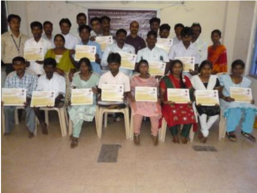
Differently abled youth of BPO Training program supported by Stitching Gilles Foundation, Belgium

PMSSS in partnership with Stitching Gilles Foundation - Belgium conducted BPO training program for the disabled. In the first batch of residential training course held at PMSSS Livelihood Training Center, Periyakalapet, 14 PWDs were trained in BPO skills, Computer skills, Life skills, Spoken English and Typewriting skills. Job placement was obtained to the trained PWDs in various IT Companies in and around Pondicherry.