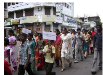
Children participation in International Anti - Child labours day rally