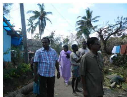
Thane Cyclone assessment by CRS Team