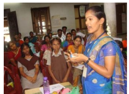
Disabled Basic Identification Training Program of Vazhundukattuvom Project