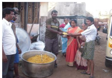
Cooked food distributed to the Thane Cyclone Affected