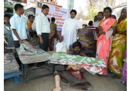
Distribution of Relief Materials to a Physically Challenged Person

PMSSS staff team made rapid assessment in the affected 3 districts and appealed to Caritas India seeking assistance at least for 20000 families. In turn Caritas India appealed to International Caritas.