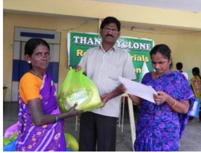
Distribution of Relief Materials by SAMSSS in Villupuram District Areas