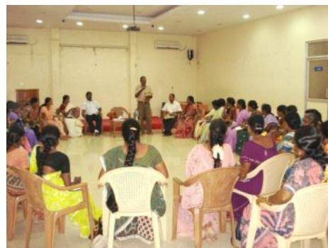
Training on Right Based & Livelihood Based Resource Support for PLF Members

PMSSS partnered with Tamil Nadu Women Development Corporation since June 2008 and organized self help groups, conduct animators, representatives training and members training in Cuddalore district. The SHG members took necessary steps to get Revolving fund, Direct and Economic loans from Government. Also the group members have been facilitated to develop themselves by availing Government schemes and Vocational Trainings.