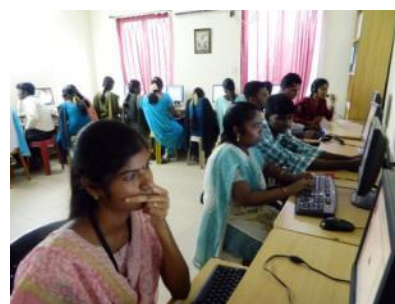
Students during Computer Skills Education Training program sponsored by INDSETI Puducherry

PMSSS, INCOIS, NIO jointly used the ICT program to disseminate the Early Warning messages through local TV channels in Pondicherry and Cuddalore, FM Radio, SMS networks since 25 th December 2011 itself for alerting the people to avoid any life and material loss during Thane Cyclone. EWS was very helpful and saved the livelihood properties of the people at large.