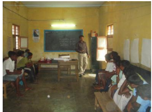
EDP Training program for Kolping Group Leaders