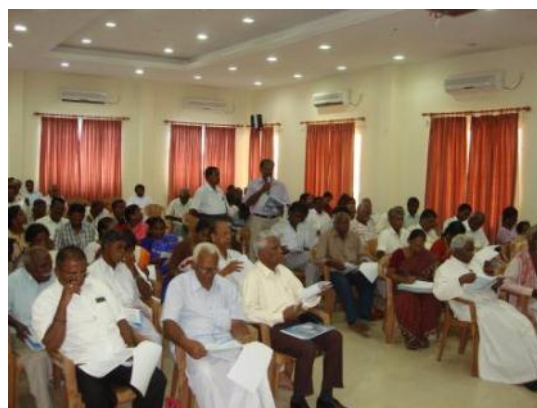
PMSSS General Body Members During Annual General Body meeting 2011

PMSSS was registered under Societies Registration Act of 1860 having 6/77 as its Register Number and as well having registration under FCRA and 12A and 80G of the Income Tax Act and mobilize resources to carry out the people's developmental activities for the past 35 years.