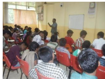
CMDRR Meeting with Panchayat Leaders