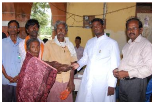
Assistance to Old Age

Sago Dharma Sabha is functioning well with the monitory support donated by well wishers, Educational institutions, Parish Priests.