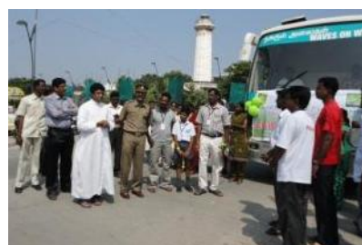
Child Line - BUS CAMPAIGN Inauguration