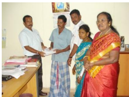
NTP Group member Nominee Receiving the LIC - JBY Death Claim

In the 4 th phase of the NT Program, the main activity was to train the CBOs in right based approach and identify the livelihood means by organizing them into right based and livelihood based expert groups. The objective was to attain social, economical, cultural and political empowerment, to identify the gaps in attaining the goal & find solution and as well to enter into right based and livelihood based activities to ensure development.