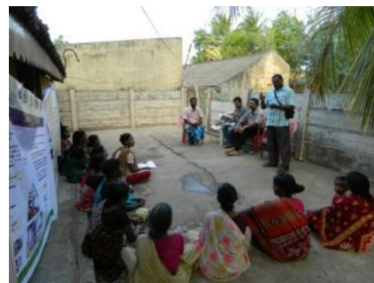
AICP Coordination Program at Chinnanellikolai

Creating a healthy community and organizing Micro enterprises towards sustainable livelihood for the SC community families at Chinnanellikolai village in Cuddalore district with the support of Department of Science and Technology, Government of India. The project got started from April 2012 and implemented until May 2015 for three years to create a model village.