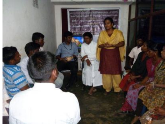
Life Skills Session of BPO Training Students