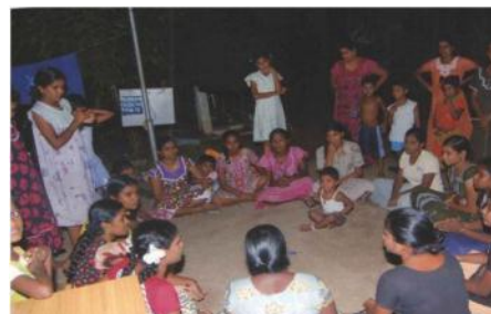
Street Corner Meeting on GBV at Refugee Camp