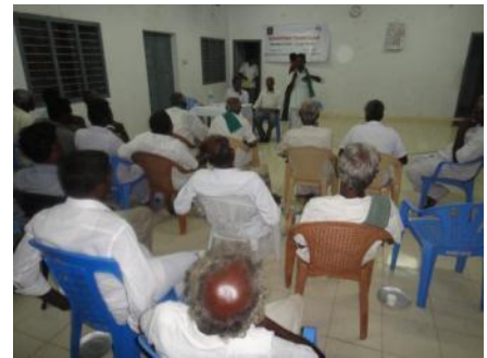
Farmers Club Meeting NABARD Cuddalore

20 members Farmers club has been organized through NABARD bank in the villages of Uchimedu, Nanamedu, Singirikudi, Rengareddipalayam, Villupalayam, Periakattupalayam, Karikan Nagar, Parvathipuram, Kokuppam, Santhavelipettai, Abathanapuram, Singirikoil. In total 200 farmers have become members in the Farmers Club.