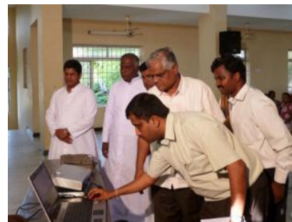
Inauguration of Early Warning Web Portal at Velankanni Shrine