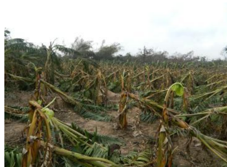
Crop Damage in Thane Cyclone

In that context of so much of destruction, it was disappointing that the cyclone did not attract the media attention and information not shared at the National and International Level. The cyclone information did not reach the International Communities and Donors. There was a gap in Information Dissemination. It was sad that the cyclone disaster not declared as a National disaster. Hence, the International Donor Organizations could not respond and came forward to extend assistance.