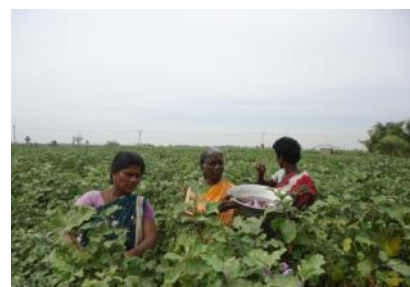
Beneficiaries of Organic Farming training conducted by IFAD are involved in Brinjal Cultivation