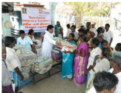
Distribution of Relief Materials to the Cyclone Victims