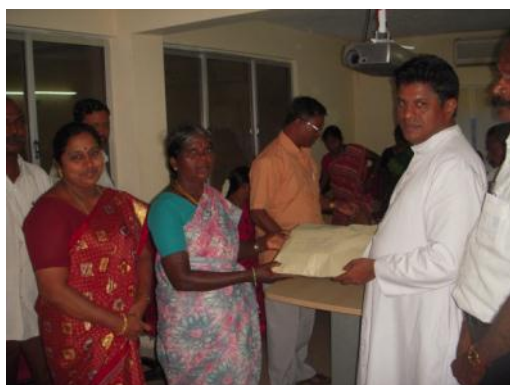
Revolving Fund Assistance to Fraternal Life Community Members

The main objective of Fraternal Life Community is that to create a family atmosphere in the villages avoiding individual perspective and bring everyone together as one community irrespective of religion, caste and creed.