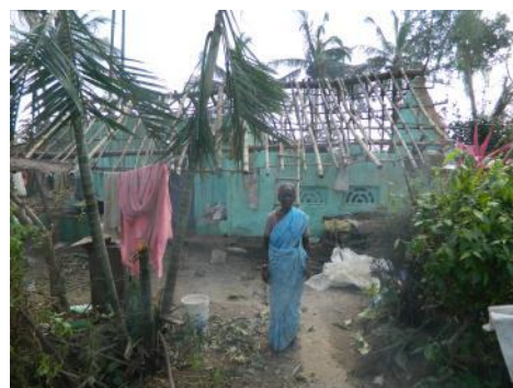
House Damage in Thane Cyclone