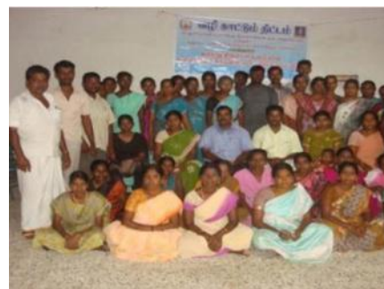
Vazhikatti Project Staff During District Level Disabled Workers Training Program