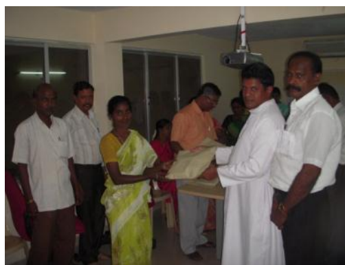
IGP Assistance to Fraternal Life Community Members