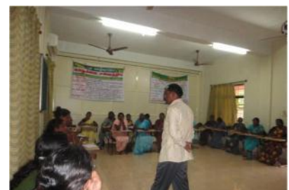
EDP Training for PLF Members

4 th phase Pudhu Vazhu Project was undertaken in partnership with Catholic Relief Services for the Rehabilitation of Sri Lankan Refugees living in Keezhputhupet, Chinnasalam (Villupuram district), Virudachalam, Kullanchavadi, Kurinjipadi and Kattumannarkoil(Cuddalore district) to ensure a safe, secured, dignified living condition and enhance their livelihood. In specific create awareness on Gender based violence among the Youth and other adult members living in the camp and reduce its impact among the camp inmates.