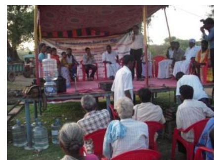
World Disability Day celebrated by CBR Federation in Villupuram District