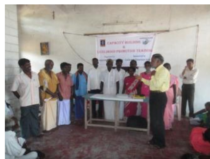
Training program for Dhobi Community Members at Thirukovilur under EPISCOPAL CONFERENCE Project