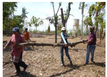
Thane Cyclone - Cleaning Work by World Bank Executives