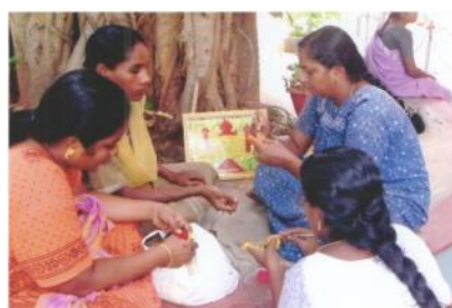
Handwork for mentally ill persons under FLSH rehabilitation program

Fraternal Life Service Home for the Mentally Ill was started in the year 1983 to rehabilitate the street roaming mentally ill brethren. So far, around 1500 mentally ill were rehabilitated in FLSH. During the year 135 mentally ill resided in the home and received medical & social rehabilitation. Now 35 mentally ill are getting residential rehabilitation.