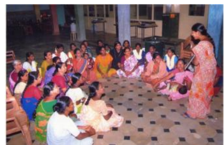
Children Parliament Training Program