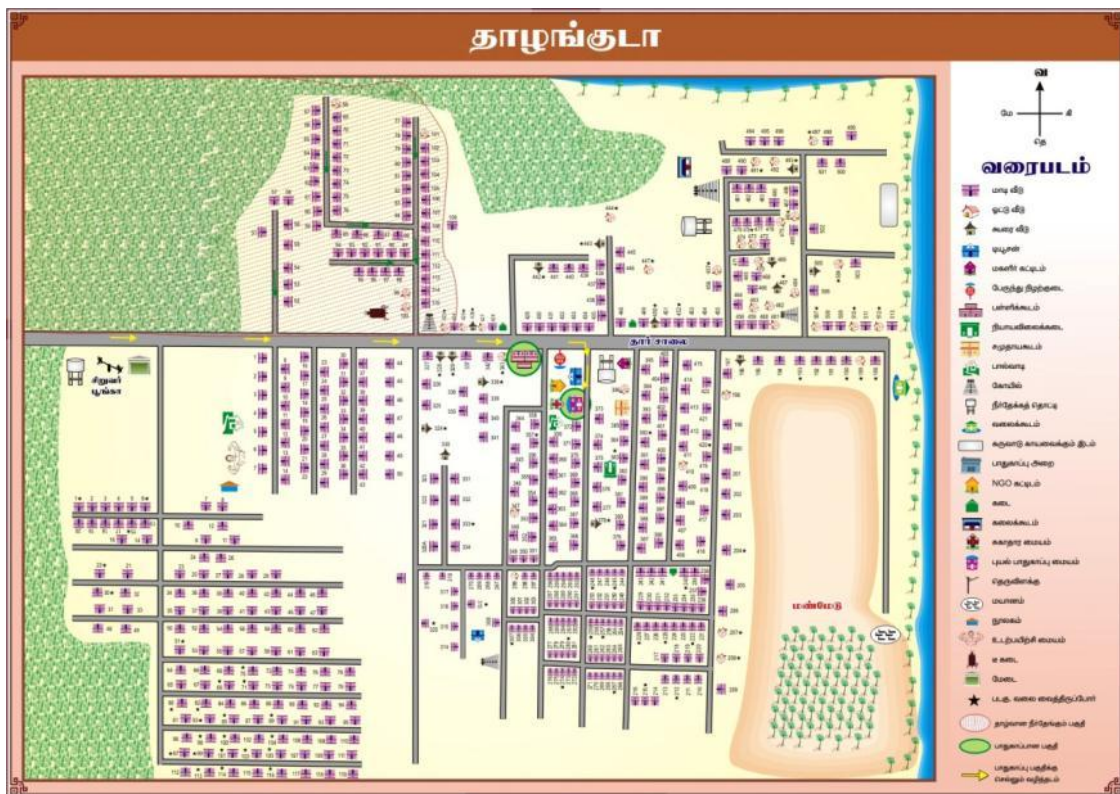
Village Disaster Reduction Map prepared with community participation at Thazhanguda Village

PMSSS in partnership with Caritas India continue to implement the CMDRR project in Cuddalore district covering Pachankuppam, Nanamedu, Suthukulam, Gundu Uppalavadi Panchayats inclusive of 16 interior hamlets towards their development. The project is undertaken also in 5 coastal villages in the jurisdiction of Pondicherry Municipal limit. Through the project intervention, capacity of 3352 belonging to 170 People's Organizations in the target villages got enhanced.