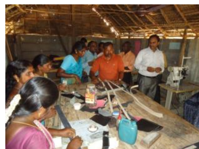
Exposure visit to Leather products making unit for IFAD PLF members