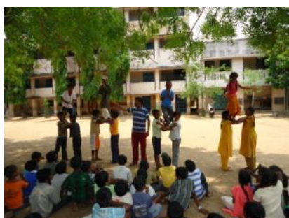
Children during Summer Camp – SCCF community development program

Trainings on Activity Based Learning, Exposure to different Government Departments like Post office, Bank, Panchayat office, trainings on Karate, Yoga, Clay modeling, Fabric painting, Summer camp, Vocational skill training for youth on Electrician, AC & Refrigeration mechanism, Driving, BPO, Beautician course, trainings on Leadership, Career Guidance, Solid waste management, Health & Hygiene, Community participation and responsibility on health, Health hazards, Sanitation, self hygiene motivation was given to fishing hamlet people. Around 1488 people participated in the above stated trainings and benefitted to a greater extent.