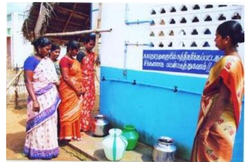
Coastal Communities collecting Purified Drinking Water from Water Purification Plant