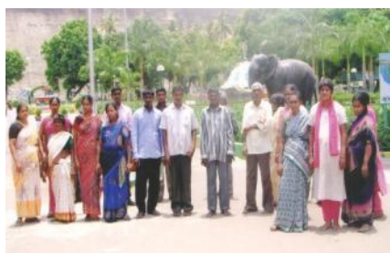
Site Seeing organized for mentally ill under FLSH rehabilitation program