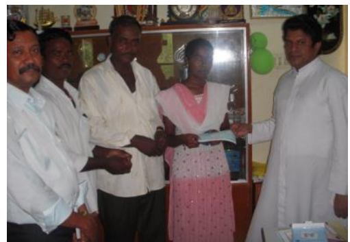
Educational Loan Assistance to Kolping Family Members