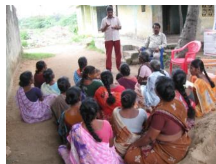
TB Awareness Program through AKSHAYA Project

Catholic Health Association of India conducted TB Awareness program for the members of Pondicherry Cuddalore Archdiocesan Health association members on 10 th March 2012.