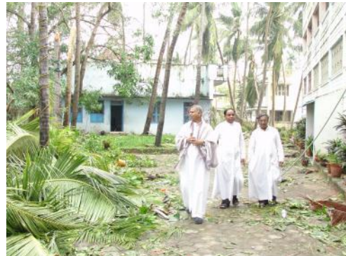
His Grace the Archbishop Visit the Thane Cyclone Affected Locations

412 families from 13 villages in Pondicherry and Cuddalore who were affected by Floods, given relief assistance received through Caritas India to the tune of Rs. 2,00,000.