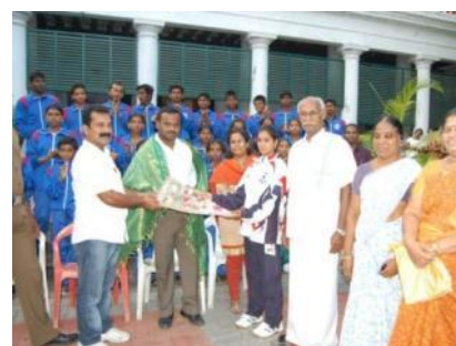
Karaikkal District Collector give send off to Karate student of Pattinacherri to participate in International competition